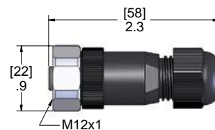
Female Straight with Female Threads