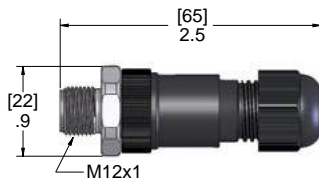
Male Straight with Male Threads