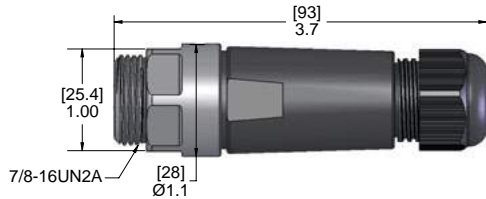
Male Straight with Male Threads

Connection via screw terminal. Voltage and amperage ratings are cable dependent and are based on 600V, 14 AWG cable. Cables with lower voltage ratings and smaller conductors will lower these ratings.